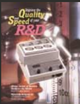
SSB2458 • STEM Reaction Blocks for Combinatorial Chemistry/Parallel Synthesis

Contact Customer Service for these Barnstead|Thermolyne Brochures & Catalogs