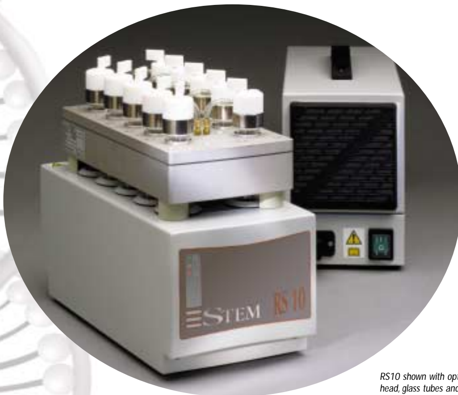
RS10 shown with optional reflux head, glass tubes and caps.