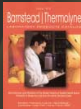
SSC2000NP • General Catalog

For inquiries from the Americas contact: