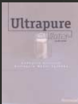
SSB2270 • Ultrapure Water Systems