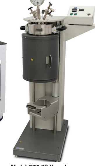
Model 4660-2G Vessel, Fixed Head Floor Stand, with Pneumatic Lift and Heater