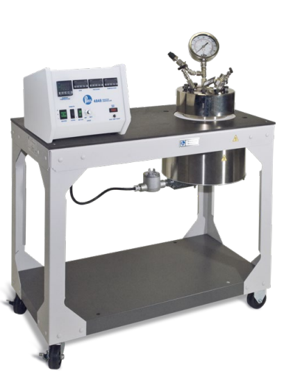
Model 4660-1G Vessel in Floor Cart with Heater and 4848 Controller