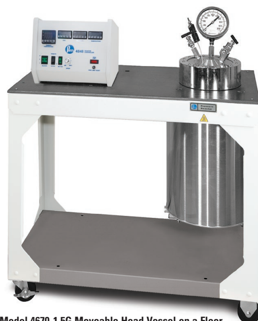
Model 4670-1.5G Moveable Head Vessel on a Floor Cart with Heater and 4848 Controller