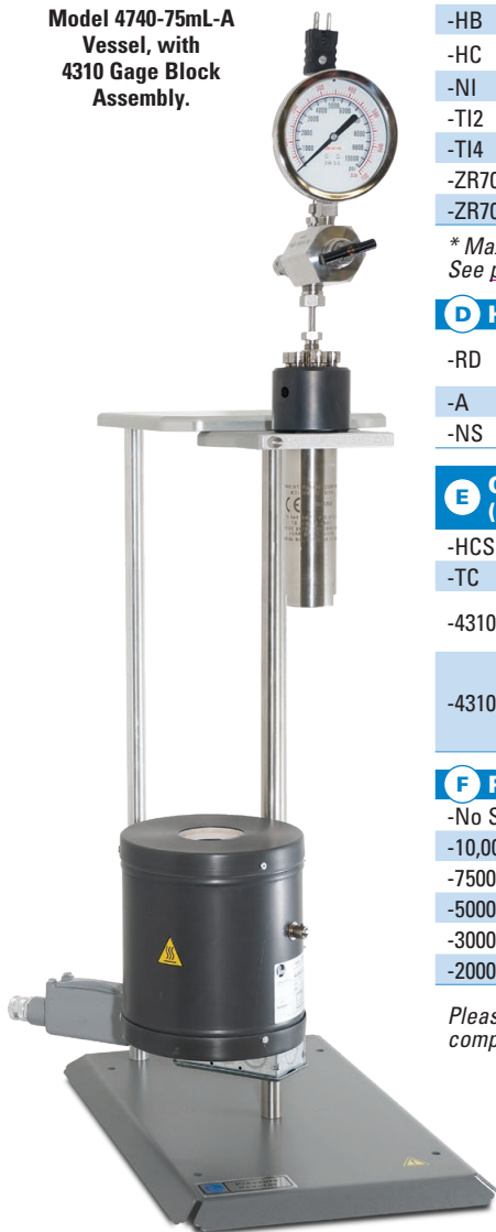
Model 4740-75mL Vessel, with bench top stand and Ceramic Fiber Heater (-BTS).

An example order number for a vessel in this series is: